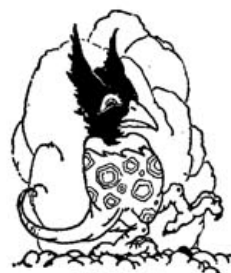
THIS IS A FUZZY WUZZY BIRD

The most original and rhythmic novelty since the famous "Hindustan"