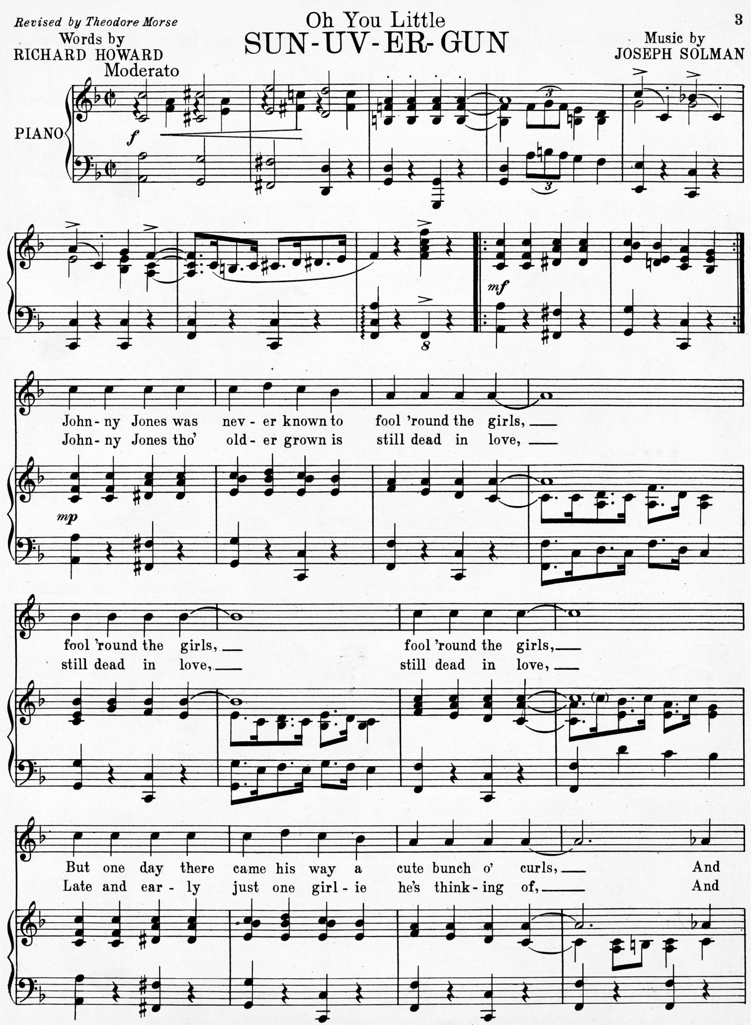
Copyright MCMXXIII by LEO.FEIST, Inc., Feist Building, New York International Copyright Secured and Reserved