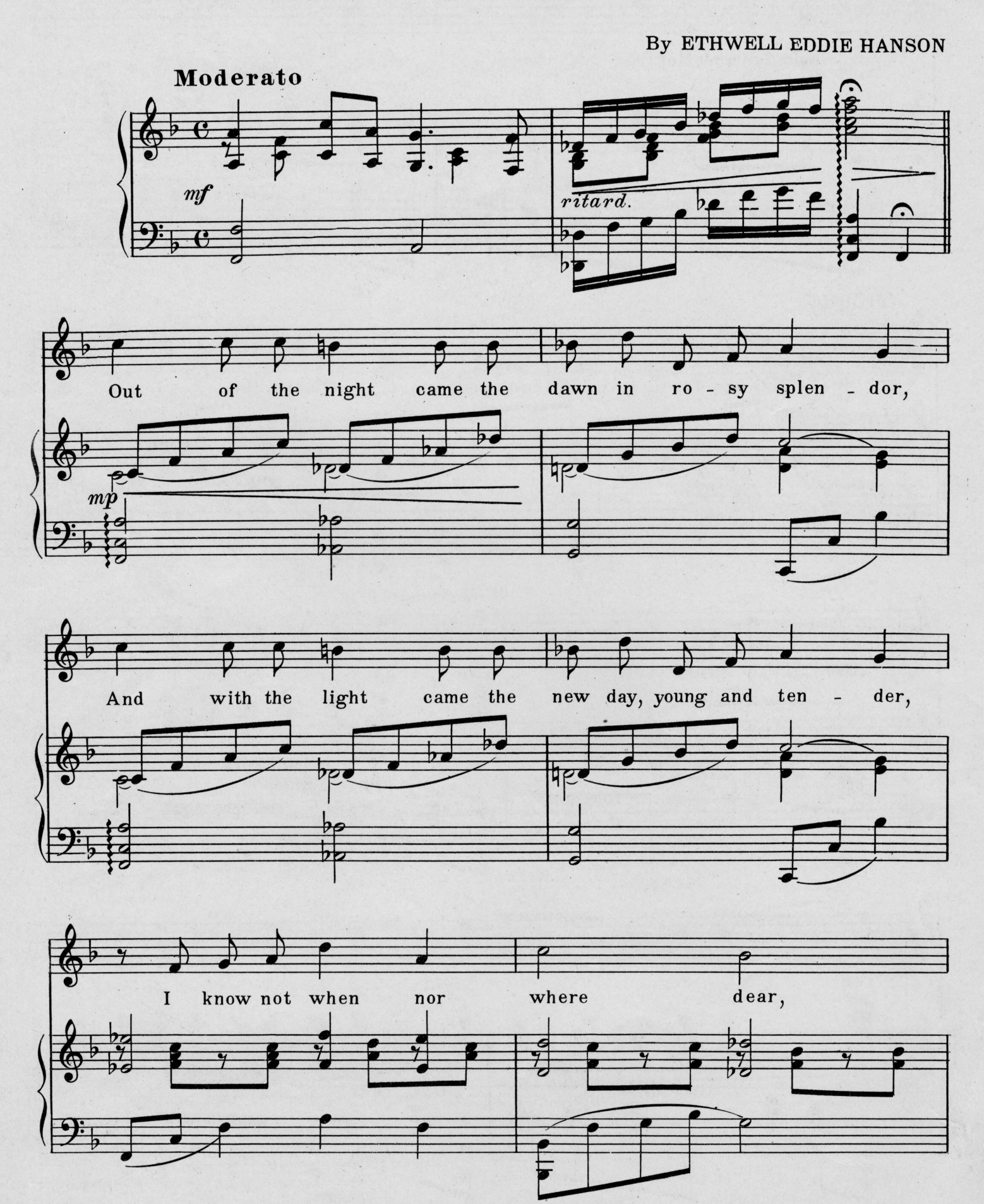
Copyright MCMXXIV by Harold Rossiter Music Co Chicago, Ill. International Copyright Secured