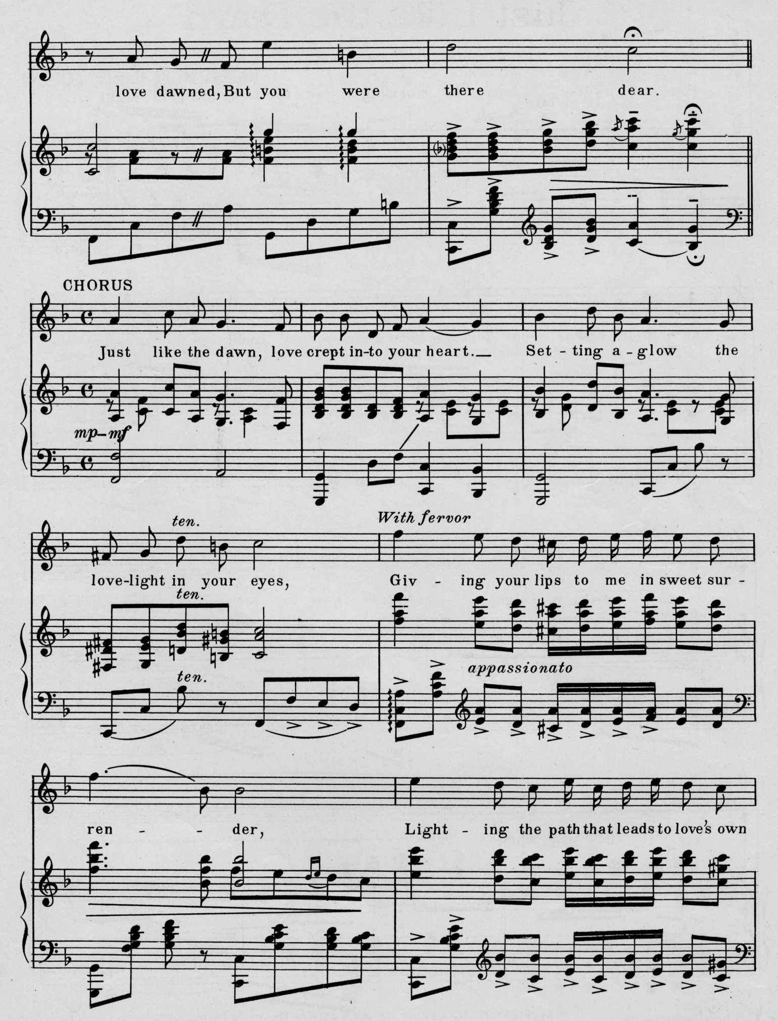
Just Like the Dawn 3